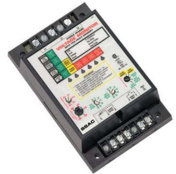
M-4152 = 208Vac M-4151 = 600Vac