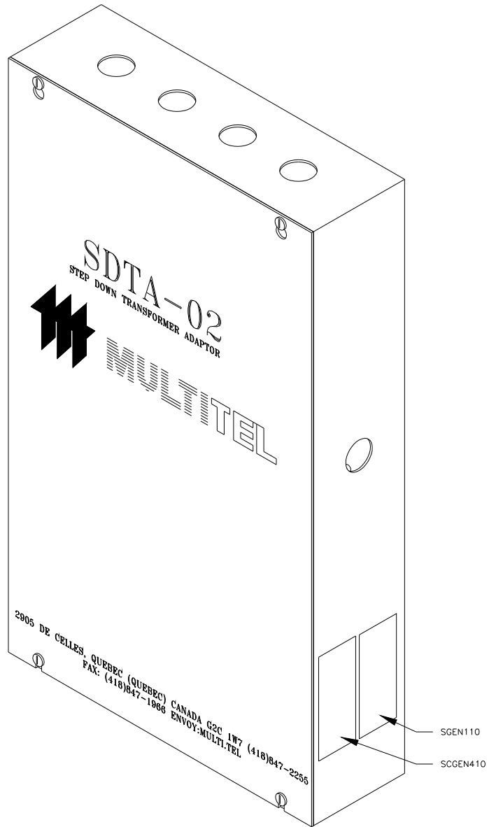
Figure 1 - Physical Aspect