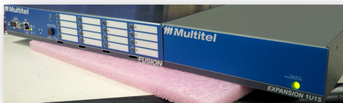
IMAGE OF THE EXPANSION 1U1S MODULE WITH A FUSION UNIT

For more detailed information on the intelligent I/O card operation, specifications, configuration and installation please refer to the FUSION - Expansion shelf user manual or the MIRADOR user manual.